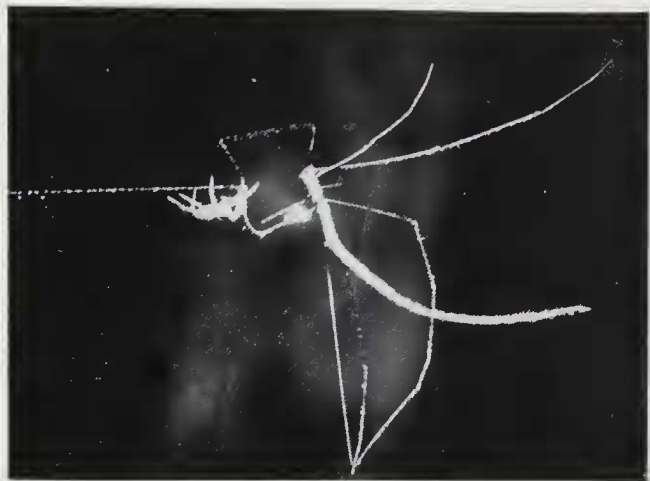
Fig. 3. Same as Fig. 2. Note that the sticky line is held on the lateral surface of the spider's right leg IV. The line to the left of the A. attenuatus is coated with white powder, while that to the right is uncoated and thus invisible.

Spilasma artifex spiderlings consistently escaped because they did not stay on the A. attenuatus lines, but descended on lines of their own, and as the A. attenuatus approached them or tried to reel them in, they let out silk faster until the A. attenuatus finally turned away.